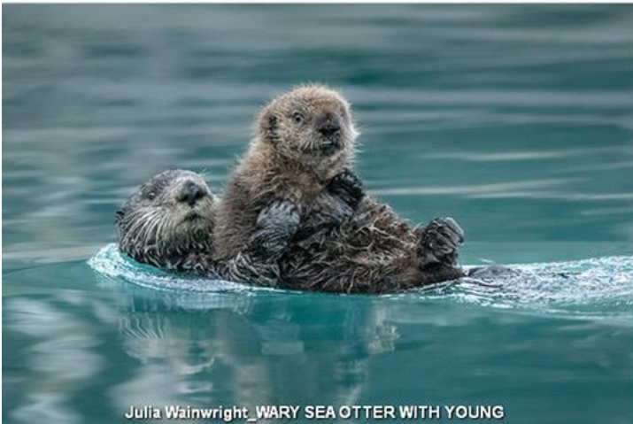
Julia Wainwright_WARY SEA OTTER WITH YOUNG