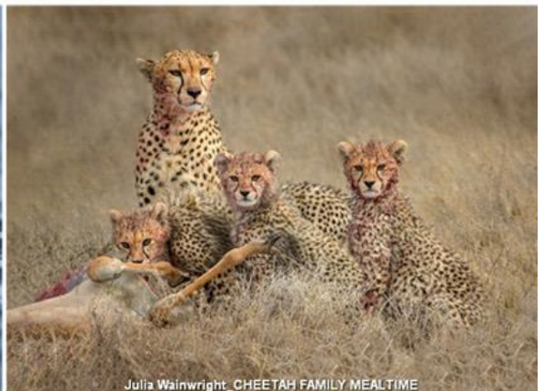
Julia Wainwright_CHEETAH FAMILY MEALTIME