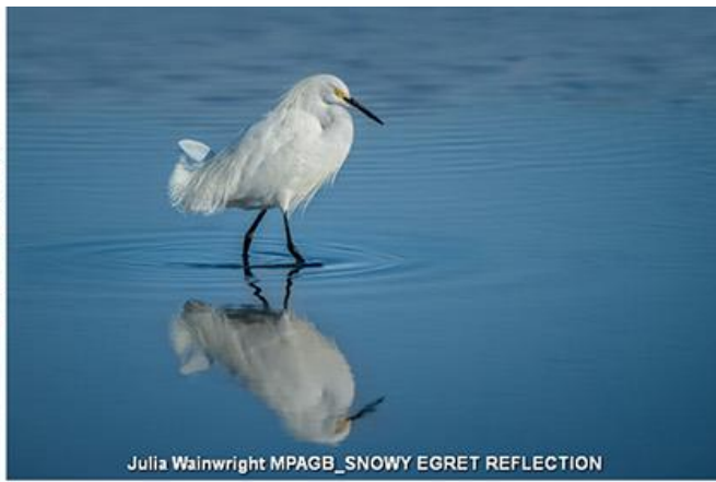
Julia Wainwright_MPAGB_SNOWY EGRET REFLECTION