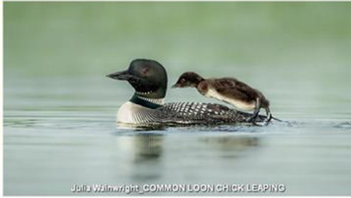
Julia Wainwright_COMMON LOON CHICK LEAPING