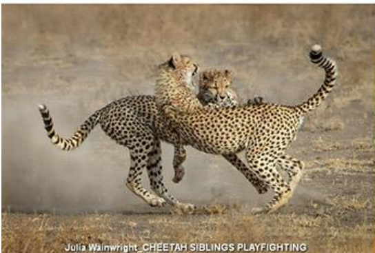
Julia Wainwright_CHEETAH SIBLINGS PLAYFIGHTING