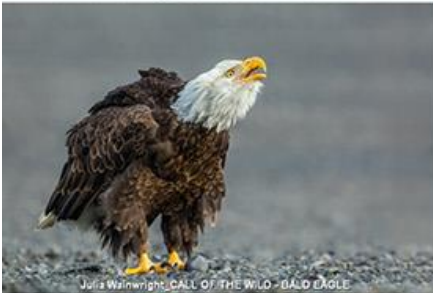
Julia Wainwright_CALL OF THE WILD - BALD EAGLE