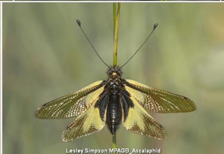
Lesley Simpson MPAGB_Ascalaphid