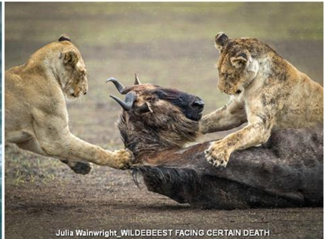
Julia Wainwright_WILDEBEEST FACING CERTAIN DEATH