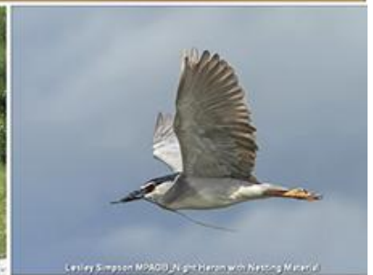
Lesley Simpson MPAGB_Night Heron with Nesting Material