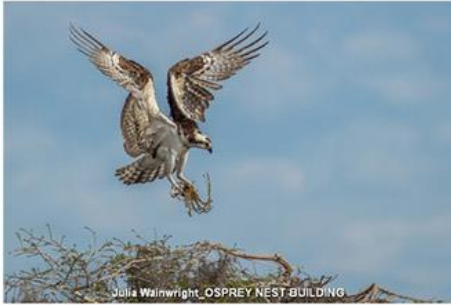
Julia Wainwright_OSPREY NEST BUILDING