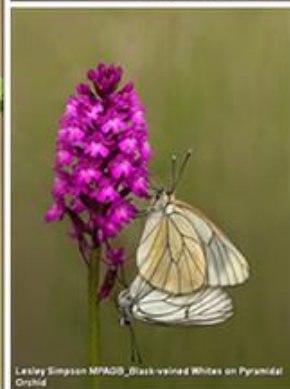
Lesley Simpson MPAGB_Black-veined Whites on Pyramidal Orchid