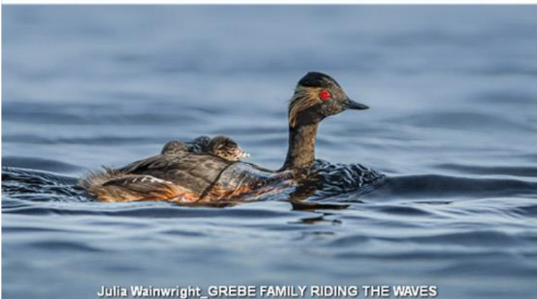
Julia Wainwright_GREBE FAMILY RIDING THE WAVES