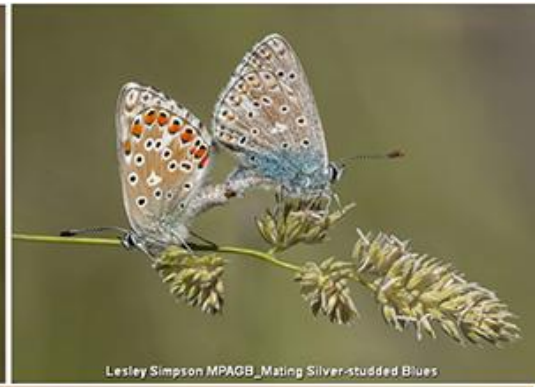
Lesley Simpson MPAGB_Mating Silver-studded Blues