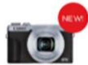
PowerShot G7 X Mark III Compact