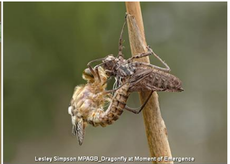
Lesley Simpson MPAGB_Dragonfly at Moment of Emergence