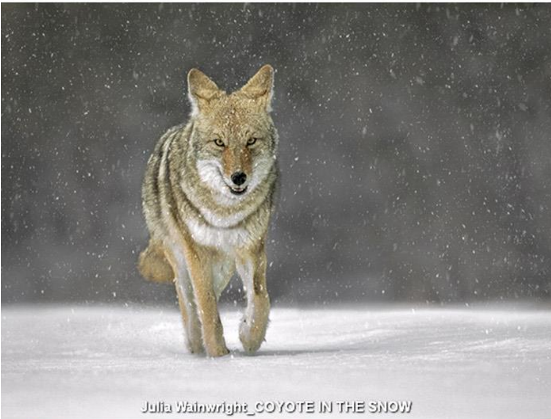
Julia Wainwright_COYOTE IN THE SNOW