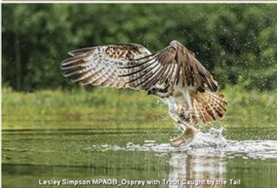
Lesley Simpson MPAGB_Osprey with Trout Caught by the Tail