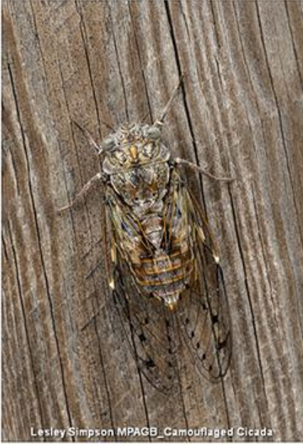
Lesley Simpson MPAGB_Camouflaged Cicada