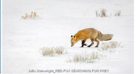
Julia Wainwright_RED FOX SEARCHING FOR PREY