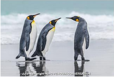
Julia Wainwright_KING PENGUIN CONVERSATION