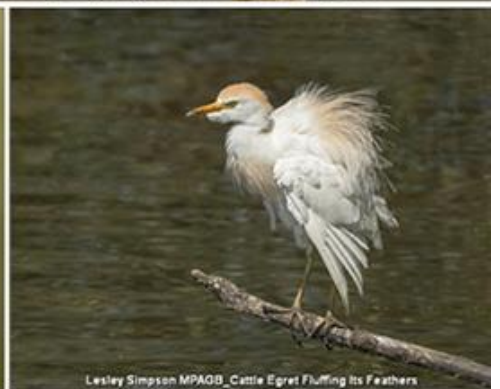
Lesley Simpson MPAGB_Cattle Egret Fluffing Its Feathers