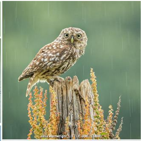
Julia Wainwright_LITTLE OWL STARE