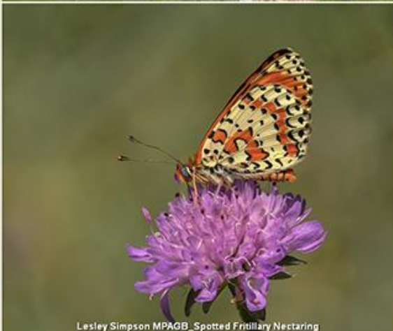
Lesley Simpson MPAGB_Spotted Fritillary Nectaring