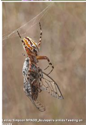
Lesley Simpson MPAGB_Aculepeira armida Feeding on Cicada