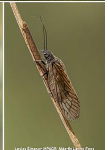
Lesley Simpson MPAGB_Alderfly Laying Eggs

CLICK ON the pictures to see them bigger on our website.